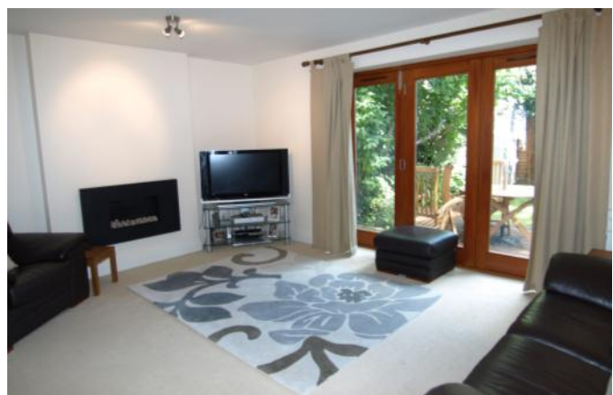
Meadow Walk, Ewell £1,695 pcm A beautifully presented three double bedroom property situated in a quiet cul-de-sac.