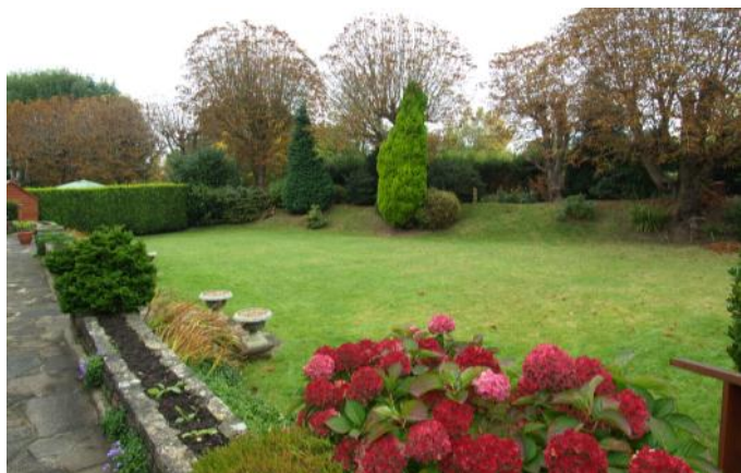
Parkers Close, Ashted £2,150 pcm Substantial five bedroom detached house with neutral décor throughout and beautiful rear gardens.