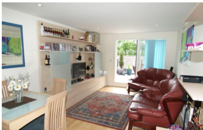
Capitol Square, Epsom £1,295 pcm A modern, luxury two double bedroom first floor apartment, finished to a high specification and close to Epsom town centre.