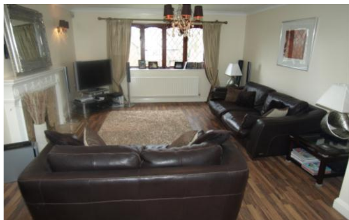
Grey Alders, Banstead £2,350 pcm A spacious four bedroom detached house, with stunning landscaped gardens set in a private cul-de-sac.