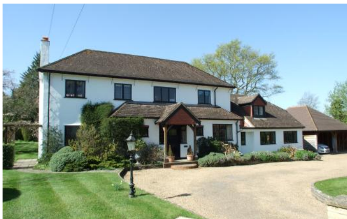
Manor House Lane, Bookham £4,500 pcm An exceptional five double bedroom detached house with a sweeping driveway and a one acre garden.