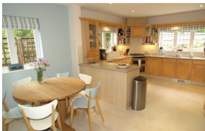
John Watkins Close, Epsom £3,100 pcm Executive five bedroom detached house, located on the sought after Clarendon Park development. With four reception rooms and triple garage.